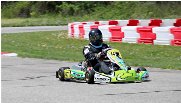
Driving Cross-Training Can Expand Mental Pace

vehicle and my surroundings. There is so much happening at such a quick pace in a kart, that a change in mental model is required. It has taken some time to get used to processing coming actions at a slower pace than influx of information is happening around me. To focus appropriately, I've had to tune out a lot of relevant information. In this setting, more than ever, I find it beneficial to reset my mental cadence whenever I'm seemingly 'out-of-sync'.