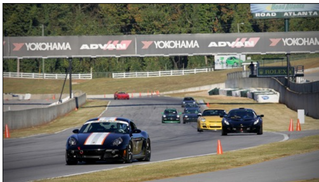
Understanding Mental Pace or Cadence Can Improve Your Performance

Driving, like all mentally intense sports, requires timing and temporal accuracy to excel. All things tend to have a frequency, or a rhythm associated with them. Likewise, when we're out on the track there is a natural cadence to our actions and a mental pace that synchronizes with (or lacks synchronization to) our movements, thought processes, and physical interaction with the world. In sports car driving, our mental time generally exists within the context of our activity. Or in other words, we think faster than actions in the car actually happen. This gives us time to consider the coming corners, the right line to take, how much brake pressure to use, the itch on our head under our helmet, and a vast array of other inputs that we choose to action or ignore.