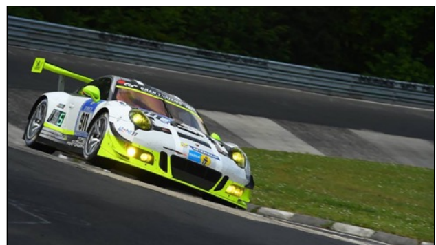
When Your Cadence is On, Performance is Effortless

What about training for mental pace? Ever notice how SLOWLY traffic moves driving home after a track event? You just spent a weekend with a greatly increased mental pace, and returning to normal makes everything around you seem very ploddingly slow. A trick that I stumbled upon a few years ago is to train on a simulator in a much faster vehicle than I drive on track. The same effect is achieved. With enough practice time, the fast vehicle will become the new 'normal', and when I return to my track car, everything seems slower. As a result, there is much more time available for decision-making.