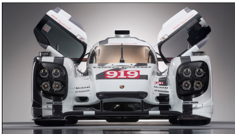
The Porsche 919 Hybrid WEC Prototype P1 Class Racecar

Next in the pro-racing pecking order is the World Endurance Championship (WEC). There are two major prizes in the WEC; the overall WEC world champion, and the winner of the 24 Hours of Le Mans. This series runs both prototype sports cars and street-based grand touring cars. From 1970 through 1998, Porsche claimed 16 overall wins at Le Mans. In 2000, Audi began an impressive string of wins resulting in 13 overall titles through 2014. After a long absence from the race, Porsche returned to the factory prototype class (P1) in 2014 with the 919 hybrid.