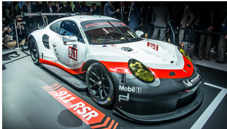
The new 2017 911 RSR - The first mid-engined 911

In 2015, Porsche returned to glory at Le Mans, and repeated the result again this year. Additionally, Porsche won the overall FIA World Endurance Manufacturer's Championship in both 2015 and 2016. Sadly, at the end of the 2016 WEC series, Audi announced that they would not be returning to P1 competition in the future. Having secured a solid stable of drivers over many years at the pinnacle of the sport, Audi's exit has both shaken-up the competitive and driver landscape in the WECs top class. Porsche also dominated the GT class in 2015, but fell off dramatically in 2016. Hopefully, the debut of a new 911 RSR for competition in 2017 will yield better results for Porsche in the coming year. 2017 will be interesting in the WEC.