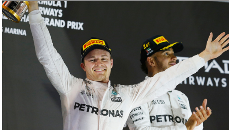
Formula 1 World Driver's Champion, Nico Rosberg

A new racing season will be upon us soon. This month we'll look at the professional racing world and the emerging landscape for drivers, teams, and of course Porsche. At the top of the racing food chain is Formula1, and as of this writing, we've just crowned a new world champion – Nico Rosberg.