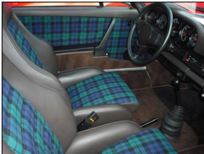
This 1976 Turbo Carrera, # 014, was featured in Excellence Magazine .