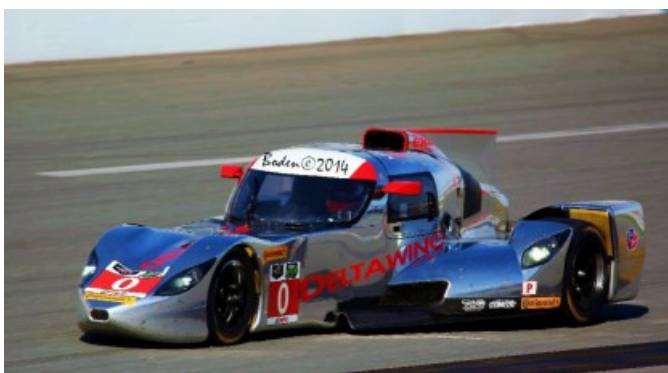
The Innovative Delta-Wing Prototype Car

The Action Express race team's Daytona Prototype collected the overall win. They barely edged out the Wayne Taylor Racing prototype car whose 4 drivers included a father and his two sons.