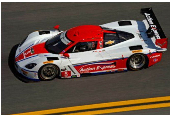
The Winning Daytona Prototype

The Action Express race team's Daytona Prototype collected the overall win. They barely edged out the Wayne Taylor Racing prototype car whose 4 drivers included a father and his two sons.