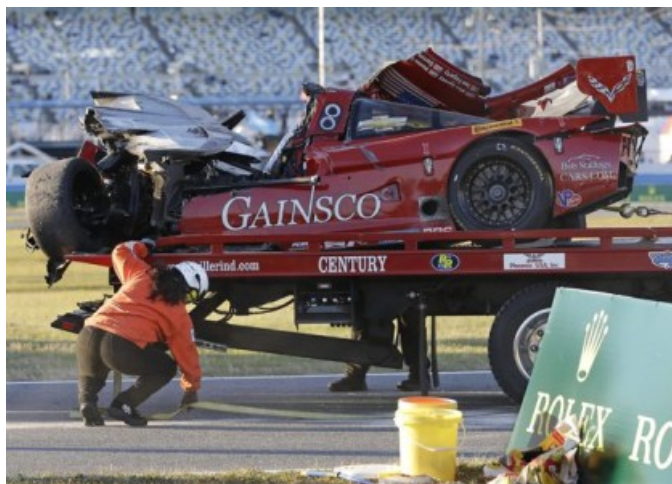
Daytona Prototype Post-Incident: A Very Scary Moment

There was significant drama this year. It seemed a car spun off track or had minor contact almost every lap, and there was a horrific collision early Saturday evening where a full-on prototype car ran into the rear of a slowing and disabled GT car. This stopped the race for a long while as crews extracted the drivers, and cleaned up the vast debris field. In the end, both drivers survived the event and should recover from their injuries.