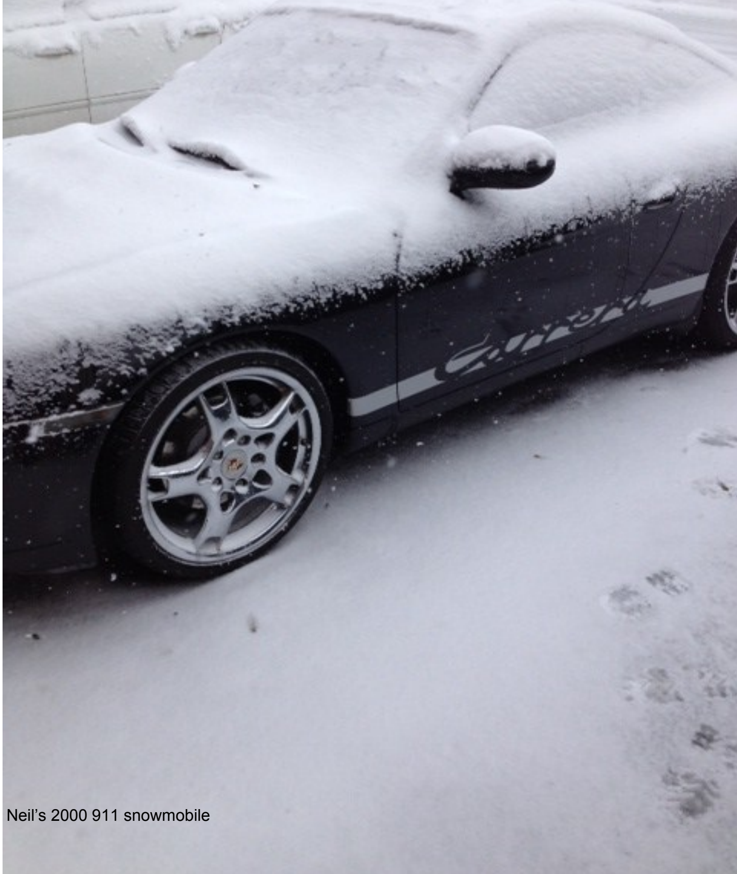
Neil's 2000 911 snowmobile