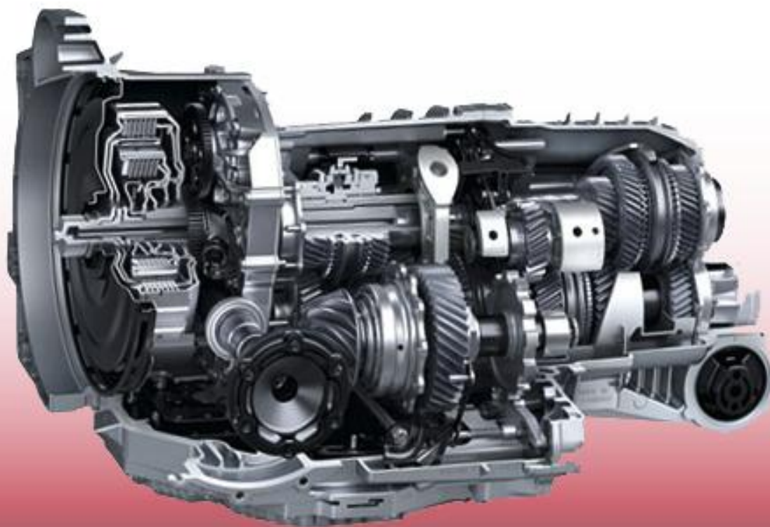
PDK (Porsche Doppelkupplung)

Additionally, because it is electronically controlled (Porsche calls this technology Intelligent Shift Program – ISP) endless hours of programming various modes of operation have taken place. As a result, the system shifts significantly faster than a human; it accurately selects the proper gear every time to