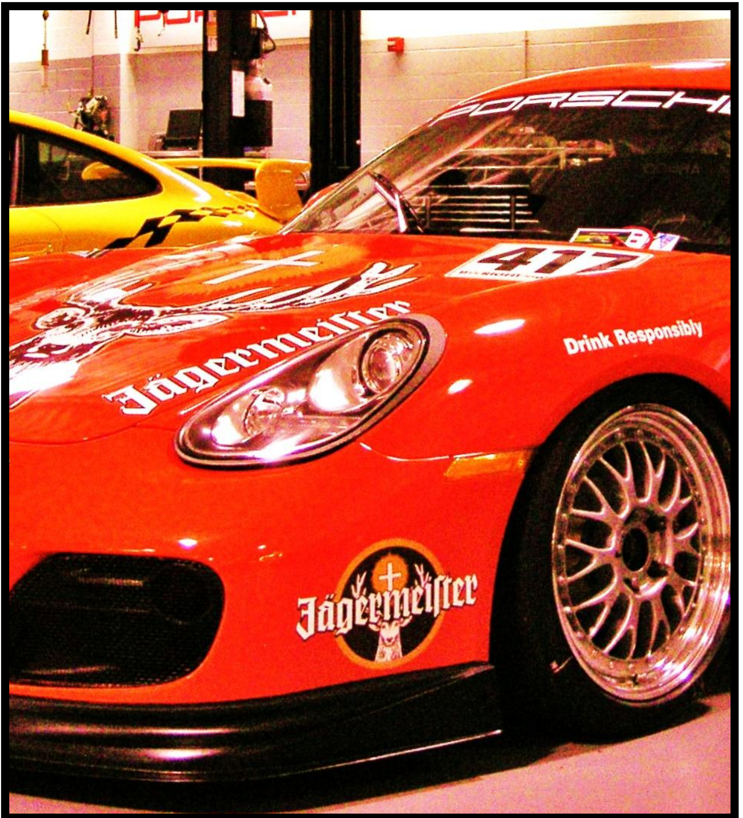
Porsche of The Village Family Tree Event IV