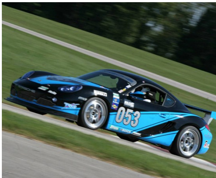
Tearing up the track in a beautiful Porsche Cayman