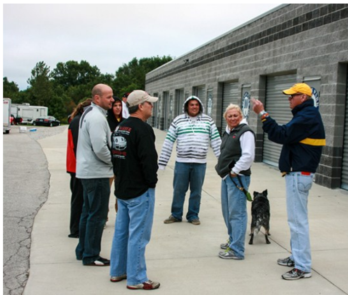
Catching-up on some early morning words of wisdom from the master

The KYPCA Fall Festival Driver Education event was run this past September 12-14. As usual, the event went off without a hitch, and thanks to sponsorship from Louisville's Blue Grass Motorsport we enjoyed a social atmosphere second-to-none in the DE community.