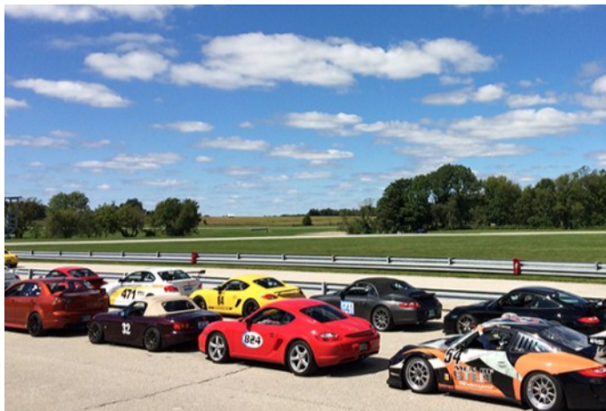
Lining up on grid – another beautiful track day ahead

Saturday and Sunday are operated in typical DE fashion with the nearly 150 participants running in 5 run groups (from novice to instructor) in 25 minute intervals. These two days are busy and intense. Novices are consumed with learning, classroom sessions, and track time, while instructors have their run groups to manage along with running sessions with one or two students.