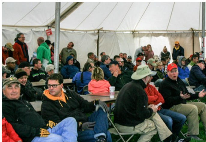
All in attendance under the big top for the driver's meeting

Friday, as history mandates, is the open-track "thank you" day for event instructors and select advanced drivers. This is a special opportunity as the track is 'open' the majority of the day from 9:00 am to track close.