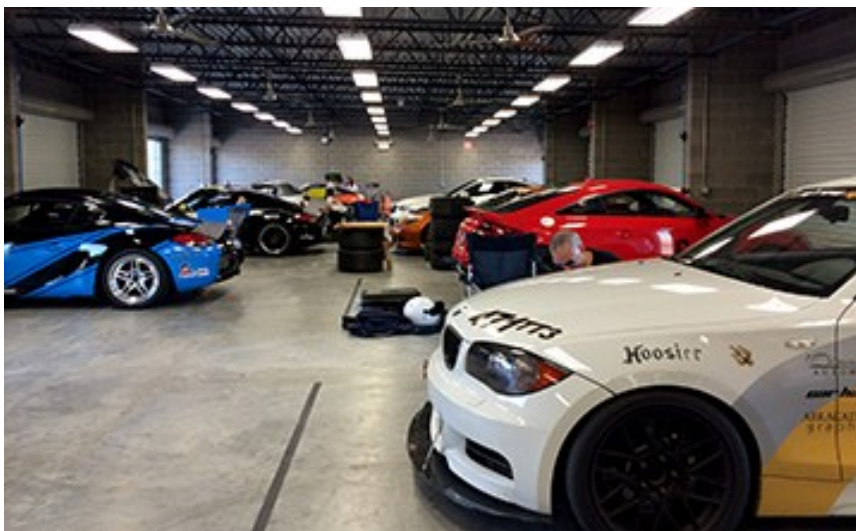
Winding down in the Putnam Garage Facility