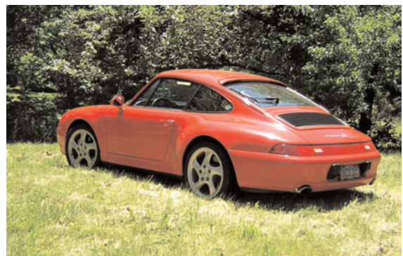
Becke Cleaver's 993 4S