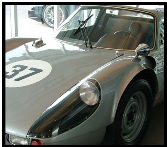
904 at Lexington Porsche