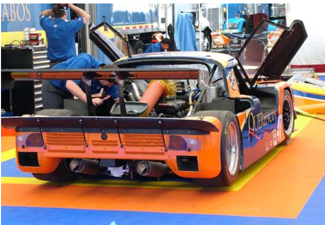
Daytona Prototype @ Mid Ohio.

By the time you read this registration should be open for three day DE at VIR on Sept 8-10. Let me know if you're planning to go.