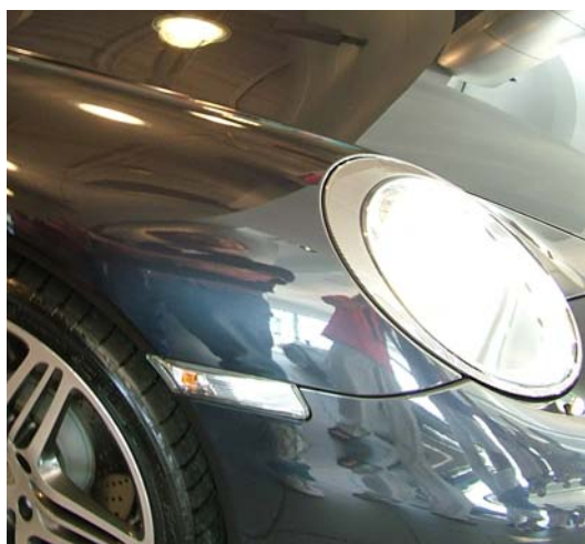
997 Turbo !