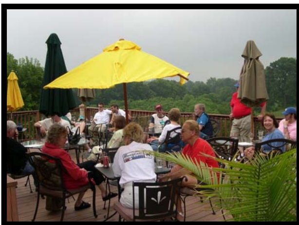
Chrisman Mill Run 06

December 10, 2006: Christmas party and monthly social at Firebrook in Lexington. Details to follow in Rumble, on chat, and updated Activities calender.