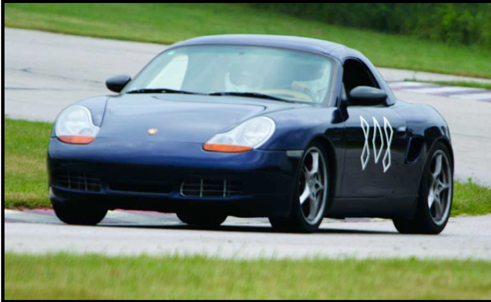
Turn 10 Photography

Benson Miller's 930 Turbo at KYPCA's Summer Heat DE