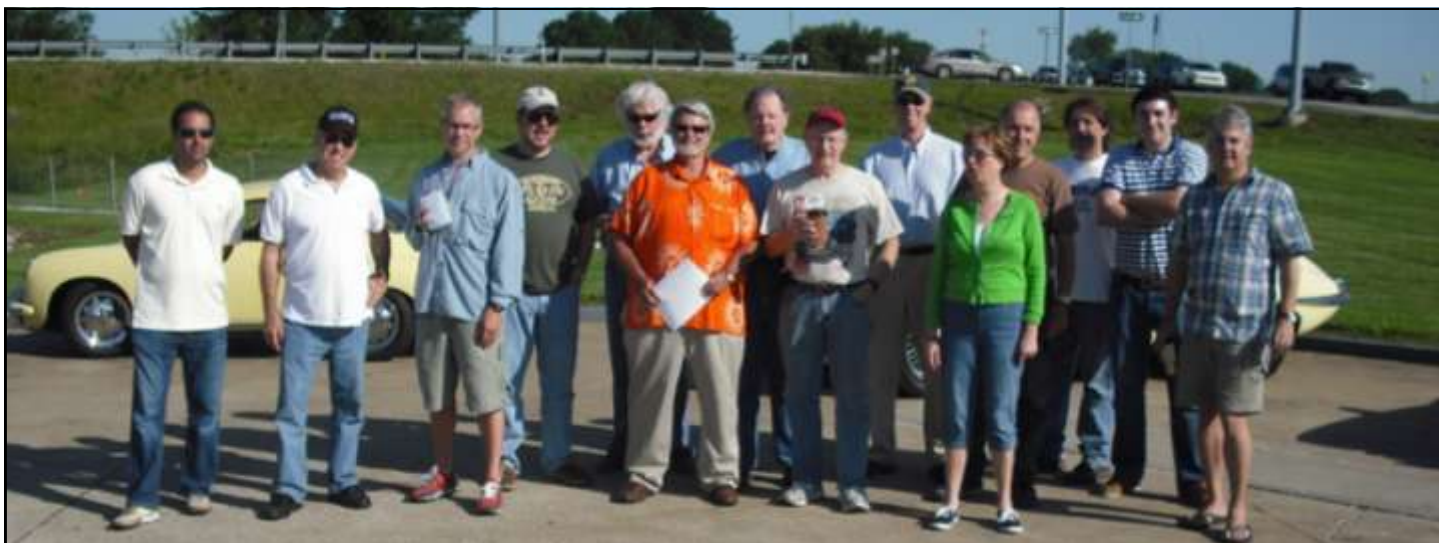
Here's the group prior to the drive from Bowling Green to TN Tubs.

is one thing, but seeing these cars at speed overtaking and fitting back into a lineup threading through traffic provides an entirely different perspective on these cars that by today's standards do not appear to be fast, but in fact can handle modern traffic quite well.