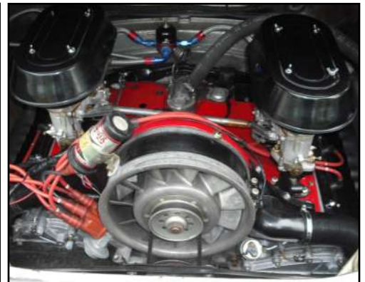
For Sale: Contact Dan Puchalski