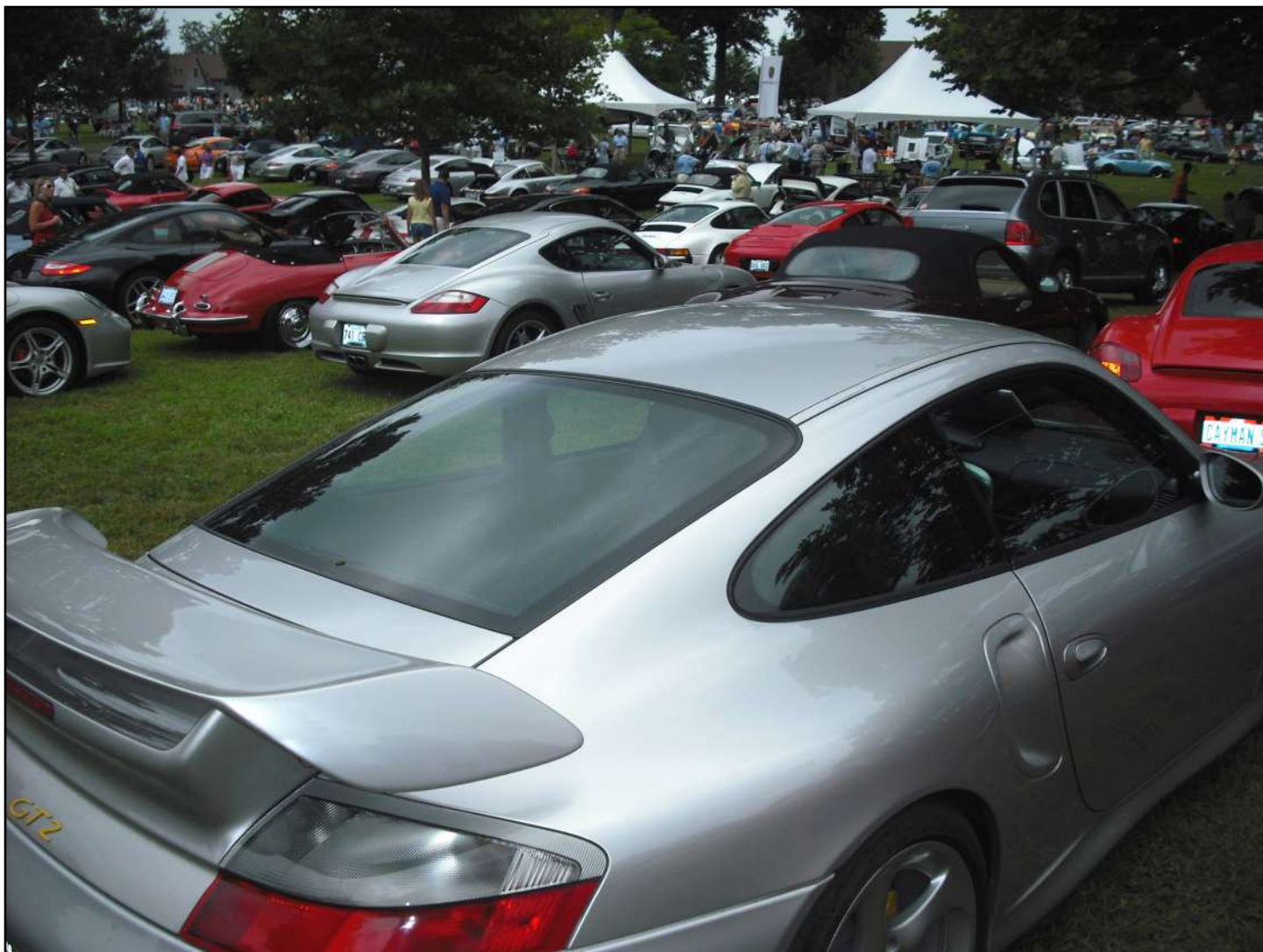
Largest assembly of Porsches in Kentucky, 2011 Keeneland Concours d'Elegance Porsche paddock