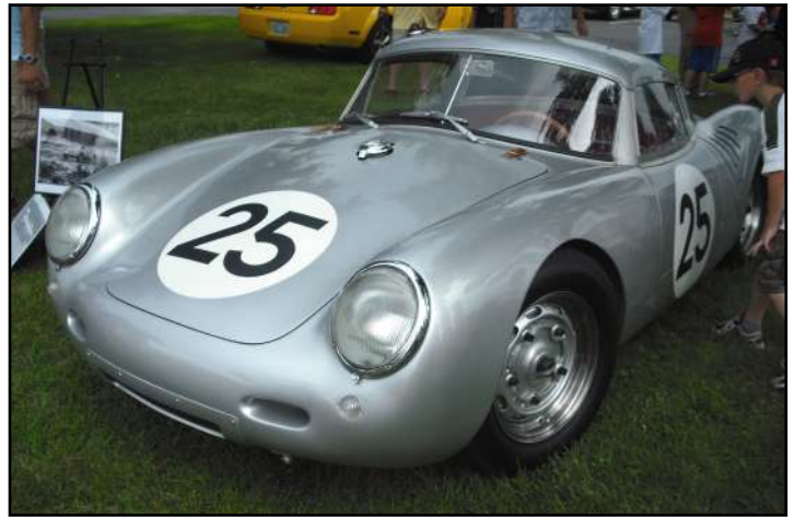
This convincing (to me) 1956 550 RS/A Lemans Coupe is a replica, representative of the cars that will be assembled in Louisville in the near future.

To learn more contact Silas Boyle at 502-376-4063.