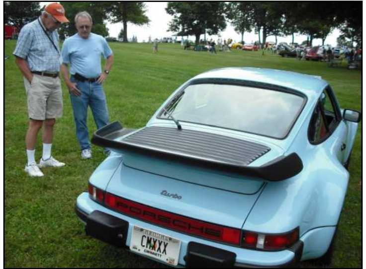
Commissioned by Gulf Oil, this is the only Gulf Blue 930 in the world.