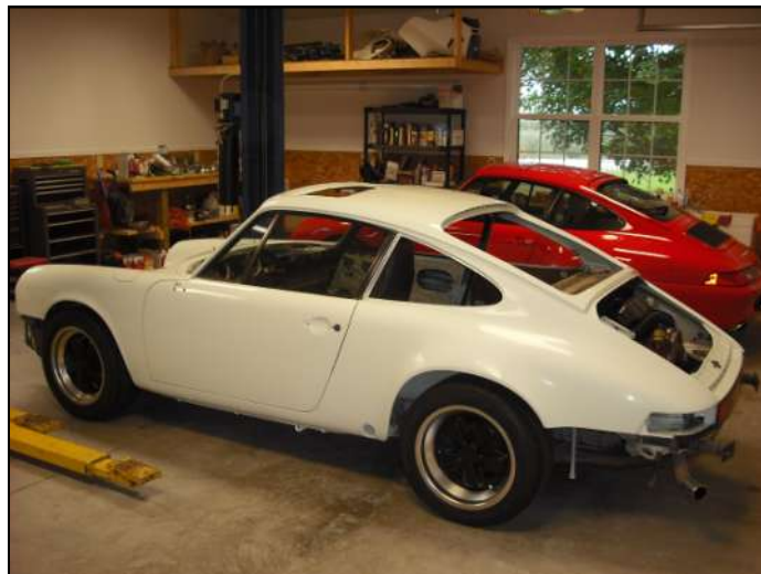
1979 911 In fresh Grand Prix White sanded with 3000 grit awaits polishing.