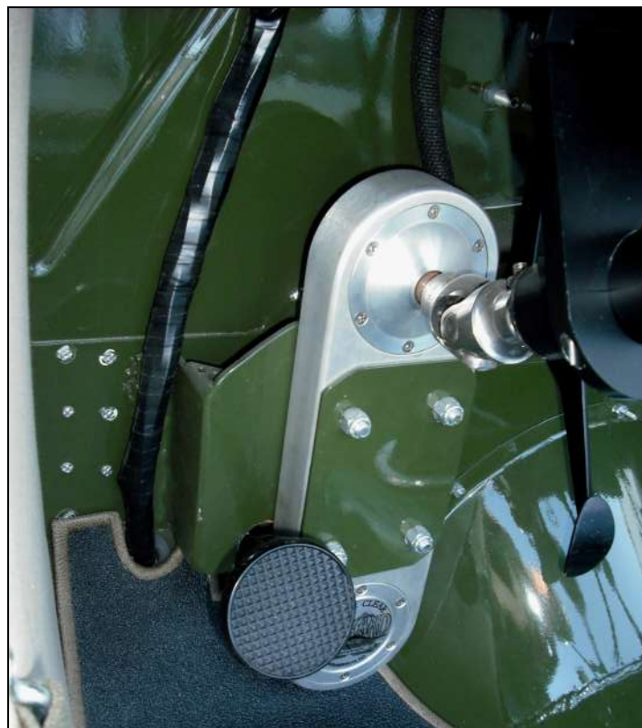
Above and right: A Steer Clear system with sprockets and chain allows the steering system to drop below the headers on the 302 Ford crate engine making 340 hp ($11k for the engine).

This car could be yours in January via the Barret-Jackson Scottsdale auction. Proceeds will benefit children of slain and disabled U.S. military.